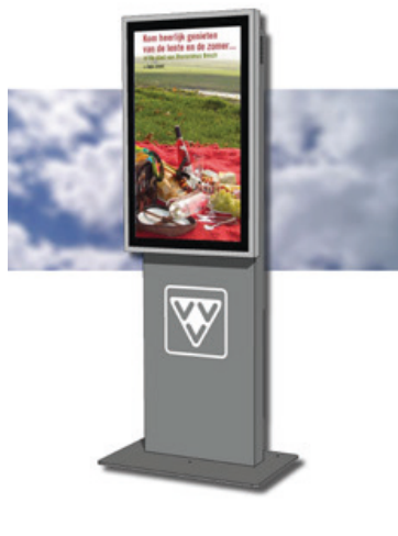
Concept: Outdoor kiosk Conrac 40 inch