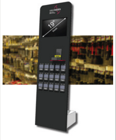
Concept: Presentation stand LG 19 inch