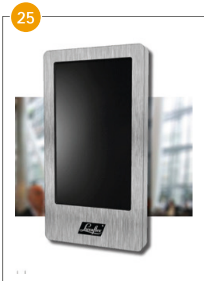
Concept: Flatscreen cover ELO 32 inch