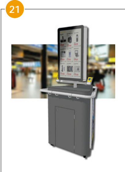
Concept: Mobile furniture ELO 42 inch