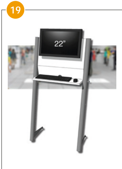
Concept: Internet stand LG 22 inch