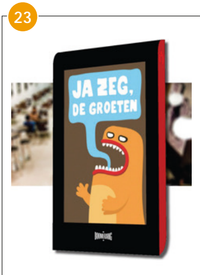
Concept: Flatscreen housing 46 inch