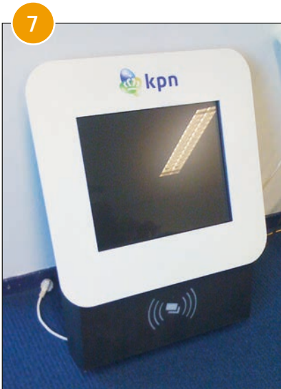
Check-In point ELO 19 inch