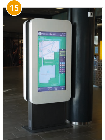
Back to Back Kiosk Hyundai 46 inch