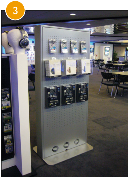
Portrait Kiosk Panasonic 47 inch Silver-Grey