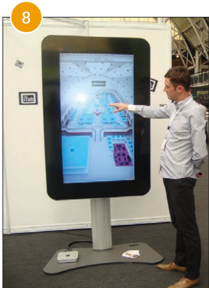
Giant-iTab C-TOUCH 55 inch