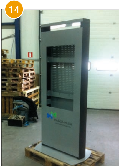
Touch Kiosk Hyundai 46 inch