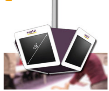
Concept: Diamond matrix LG 19 inch