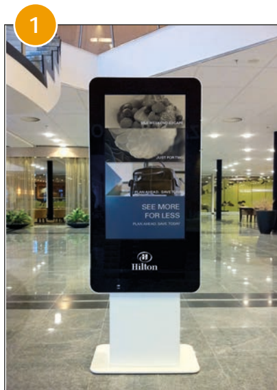
Touch Kiosk C-TOUCH 46 inch White/Black