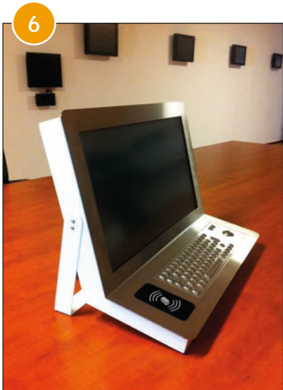
Internet Kiosk ELO 22 inch