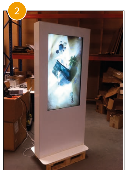
Touch Kiosk C-TOUCH 46 inch White