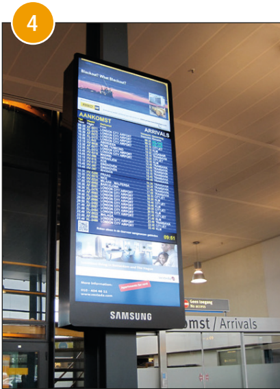
Matrix 1x4 Samsung 46 inch