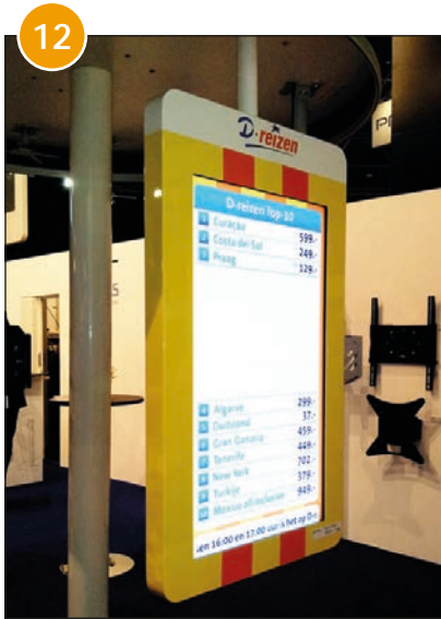
Flat Panel Housing LG 42 inch