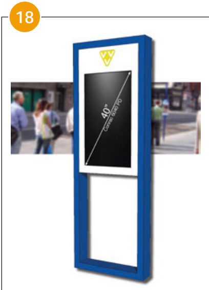
Concept: Outdoor kiosk Conrac 40 inch