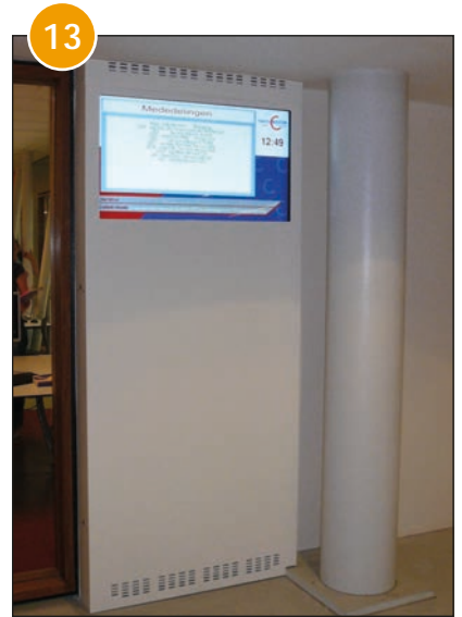
Flat Panel Cover Samsung 40 inch