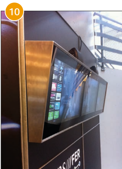
Flat Panel Housing Sharp 37 inch