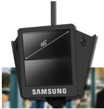
Concept: Diamond matrix Samsung 46 inch