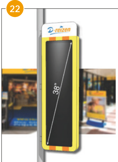
Concept: Window display LG 38 inch