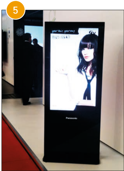
Portrait Kiosk Panasonic 47 inch Black