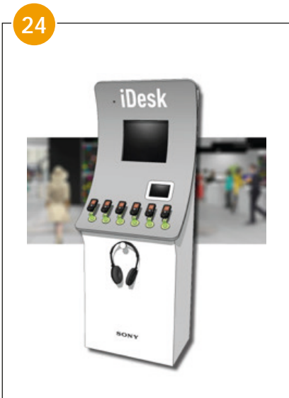
Concept: iDesk ELO 22 inch