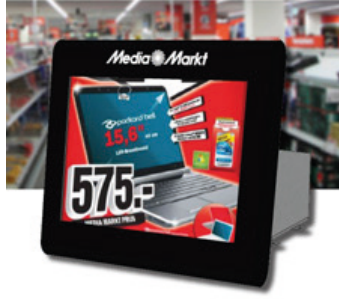
Concept: Shelf display for Tablet 10 inch