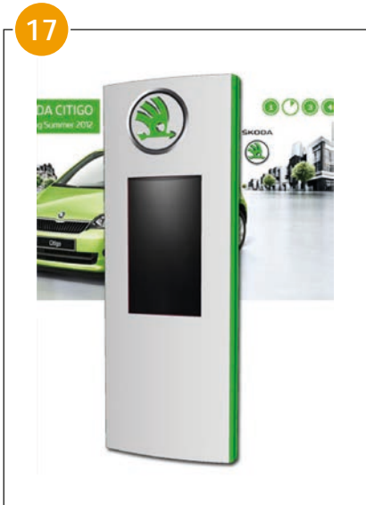
Concept: Outdoor kiosk Conrac 40 inch