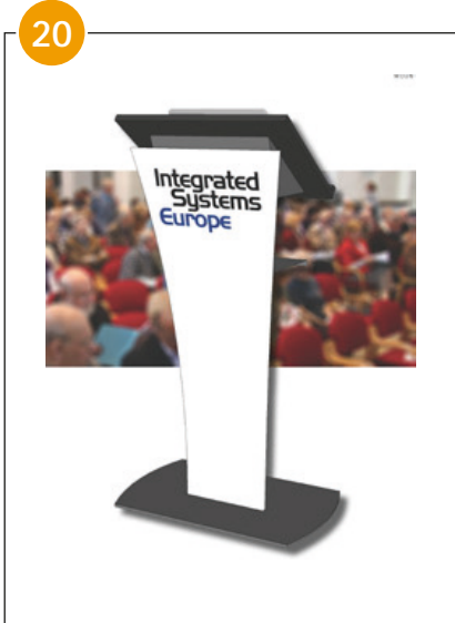
Concept: Lectern Laptop 15 inch