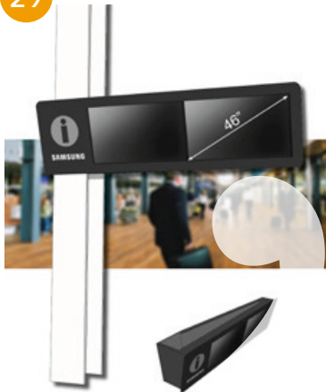
Concept: Matrix 2x1 Samsung 46 inch